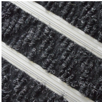
Berber Point Charcoal